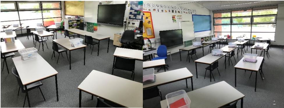
Image Set 1: Class 1 and a KS2 set up. EYFS will be adapted next week and we will share pictures of our provision and how we have adapted it! Emergency provision group one will have a mix of formal and EYFS style provision.

Every child Y1-6 will have their own box of resources to access which can be supplemented with their own pencil case and water bottle, etc. Coat pegs will not be used. Everything should be kept together. Where red tape is seen these resources cannot be accessed by children.